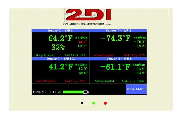
Tv2 for wired or wireless sensors